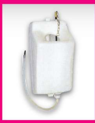
Small Water Tank