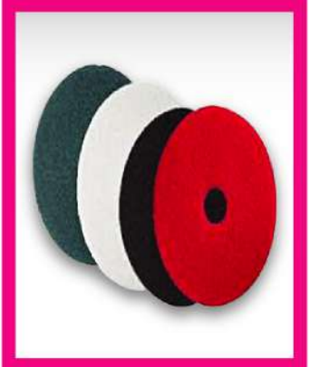
3M Scrubbing Pad