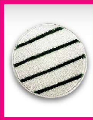
Bonet Pad - for Carpet