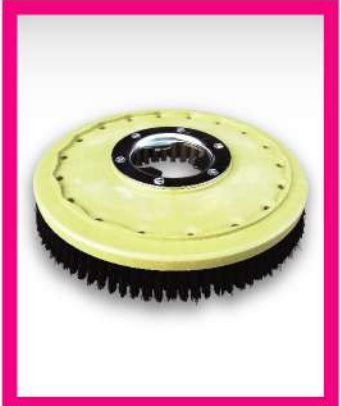
16 inch Scrubbing pad - soft for carpet