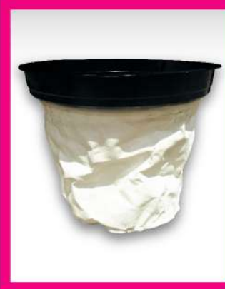
Vacuum Filter Bag