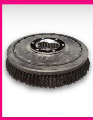
16 inch Scrubbing Pad